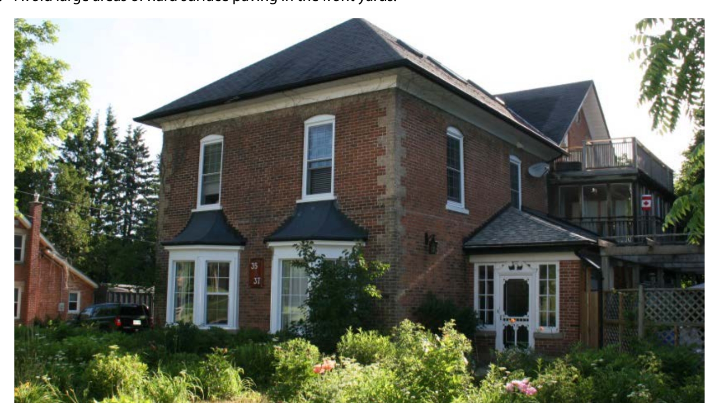
35/37 First Street