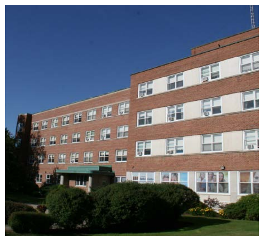
Former Dufferin Area Hospital now the Lord Dufferin Centre, First Street