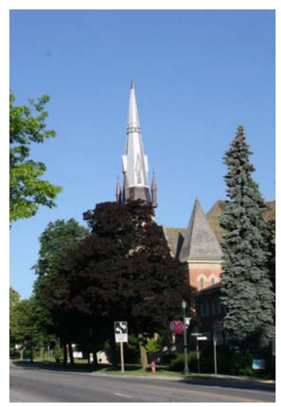
Westminster United Church, Broadway

The Residential Guidelines apply to the conservation, maintenance and any proposed alterations to the institutional buildings and properties or their character-defining features.