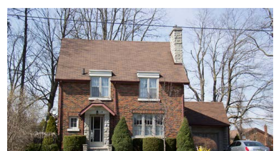
English Vernacular Cottage – 14 York Street

Single examples of other styles such as Dutch Colonial and Period Revivals like the English vernacular cottage are found throughout the Study Areas.