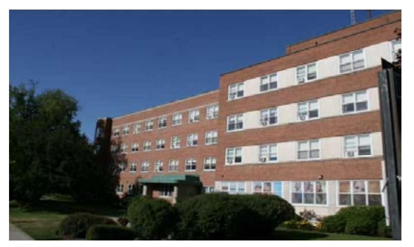
Former Dufferin Area Hospital, First Street