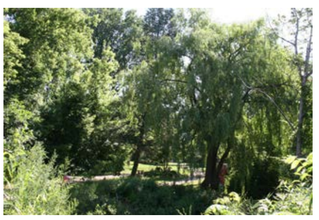
Mill Creek east of Bythia Street