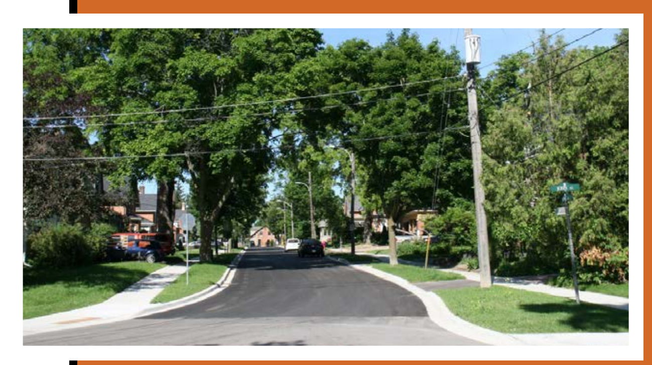
Heritage Conservation District Plan Merchants and Prince of Wales