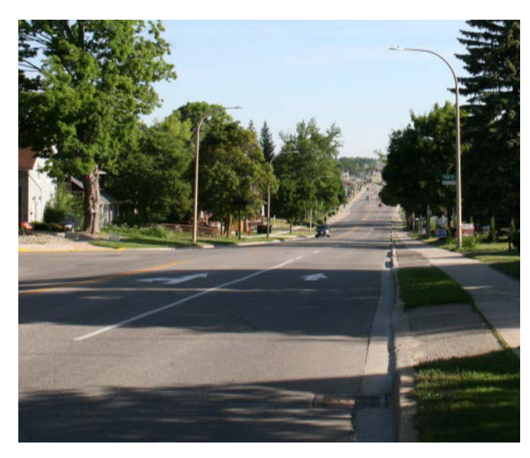
First Street looking north from Third Avenue

First Street and Broadway as visual and functional gateways to the Downtown HCD; where green space and mature trees in front yards and on boulevards along these streets gives way to the openness of the commercial core;