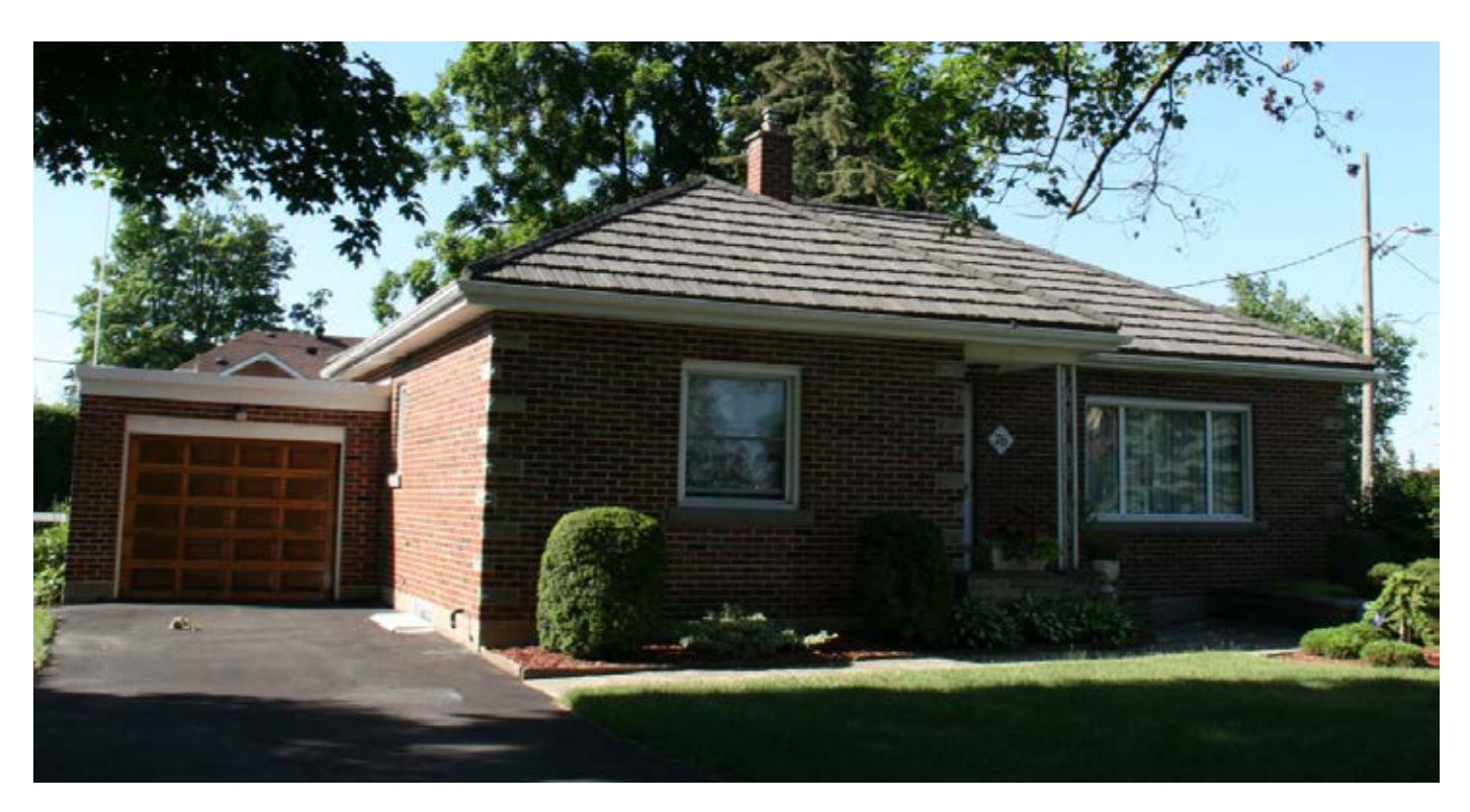
76 Zina Street