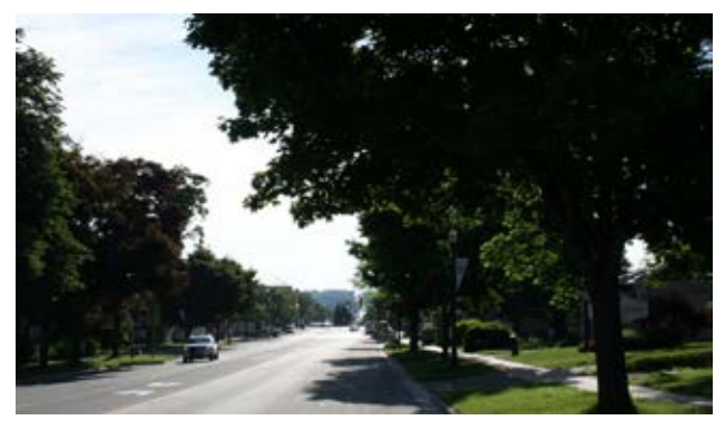
Broadway looking east from Bythia Street

Unobstructed and traditional view corridors descending west to east along Broadway into the downtown commercial core and the slopes of the east side of the Credit River valley beyond;