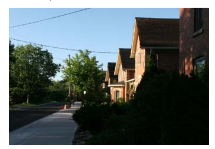
Bythia Street south of Broadway