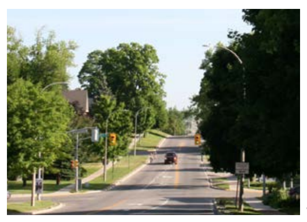
Broadway looking east from Bythia Street

Unobstructed and traditional view corridors toward the downtown core moving north to south along First Street;