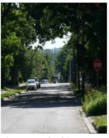
Zina Street looking east