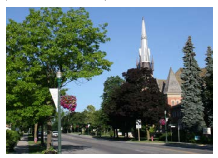
Westminster United Church, Broadway

Unobstructed and traditional views of the large landmark buildings rising above the tree canopy which punctuate the streetscapes.