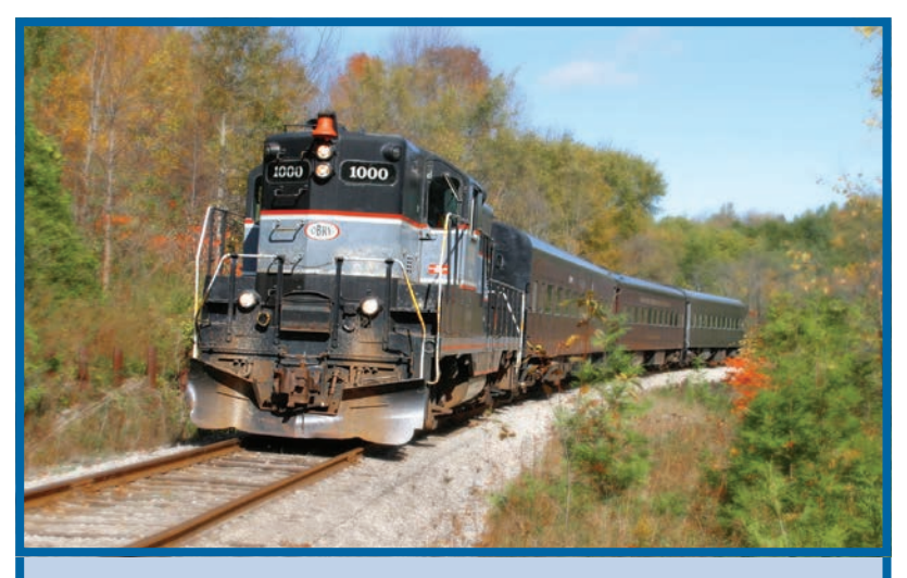
The popular Credit Valley Explorer hosted 14,198 guests on 66 excursions in 2014