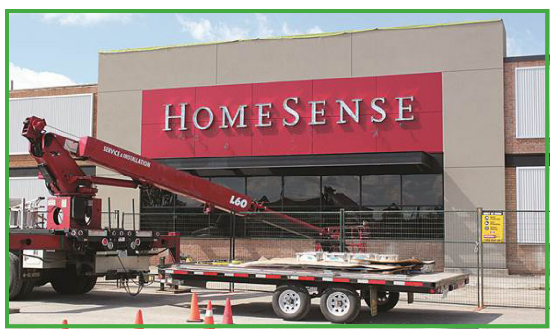
Home Sense underwent renovations