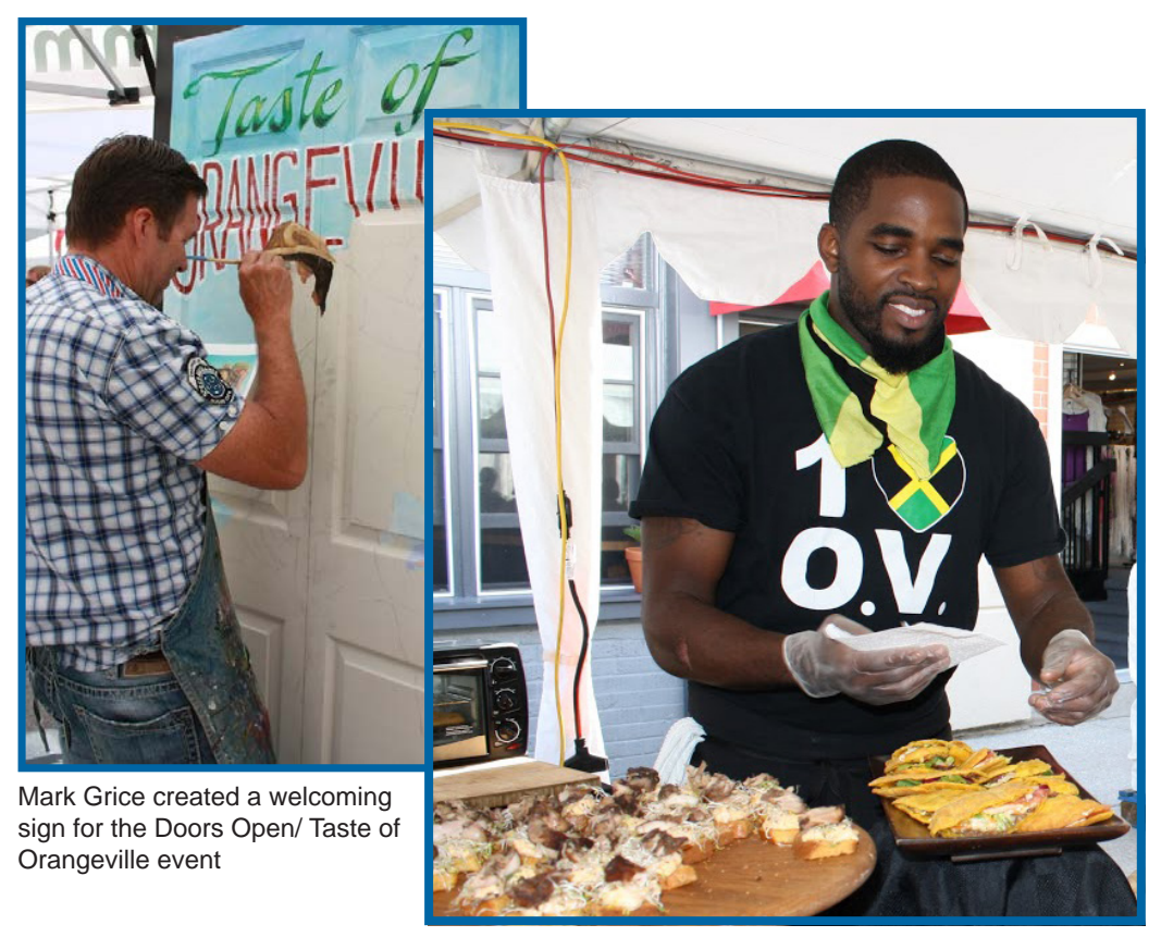
Taste of Orangeville was a popular downtown event in August

On August 16, Orangeville's restaurants welcomed guests to sample fare from various Orangeville restaurants including Bluebird Café, Mill Creek Pub, Soulyve, and Forage. The event included live music, shopping and a beer tent and allowed guests to experience all the best that Orangeville has to offer.