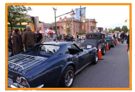
Car show on Broadway for Blues and Jazz Festival

Orangeville's Blues and Jazz Festival was held from June 6-8 in 2014 and was selected as one of the Top 100 Festivals and Events in Ontario for the fourth year in a row! The festival brings $1.1 million of visitor spending to the town and surrounding areas<sup>22</sup>.