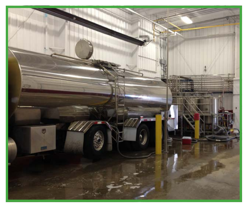
Woolwich Dairy added a milk bay to its operation