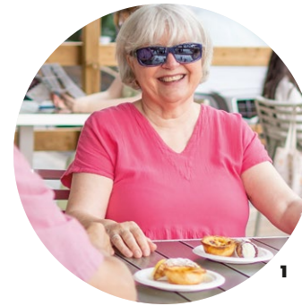
A celebration of great food and good company at RustiK Local Bistro